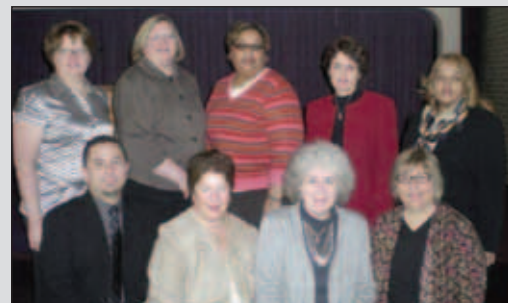
NOVA Board January 2009