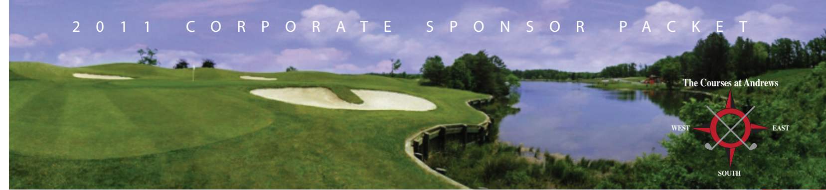
The Courses at Andrews