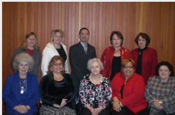
NOVA Board of Directors