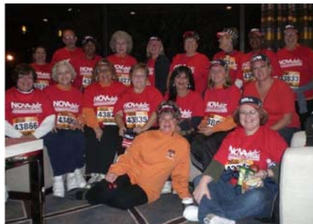
Marine Corps Marathon